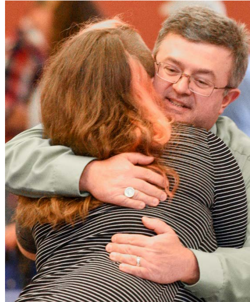
Hugs abounded at Student Awards Day in Founders Hall at Butler County Community College on April 18, 2017.

“But I realized that if I can do it this semester, I can definitely do it next semester,” she says.